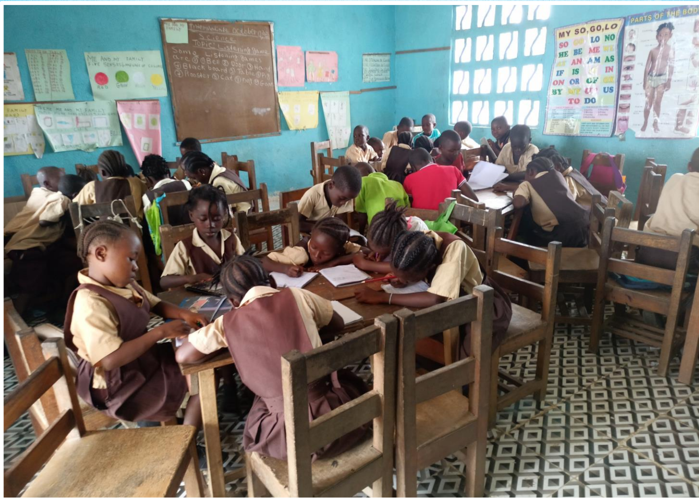
Fefeh Town Public School