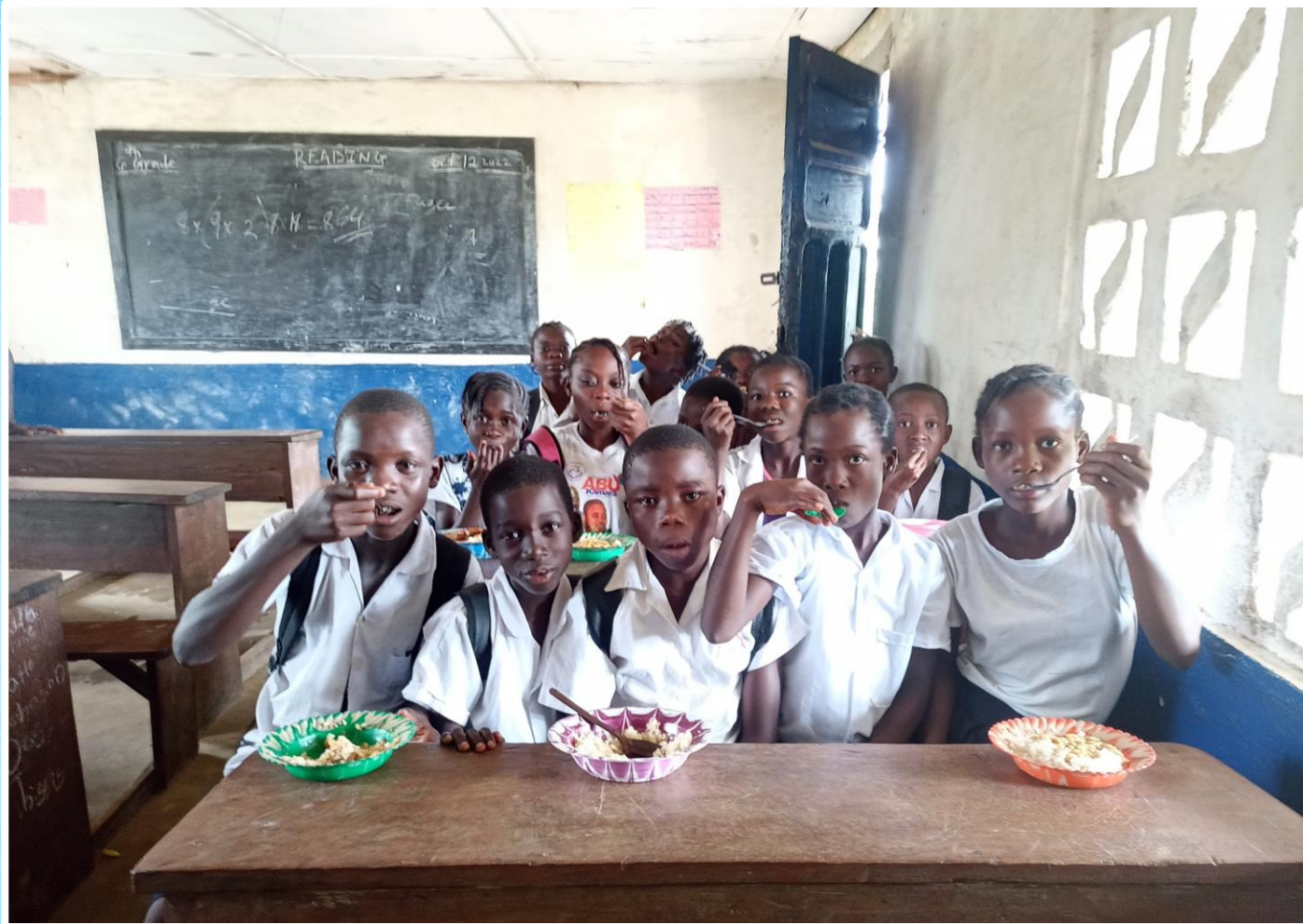
Fefeh Town Public School