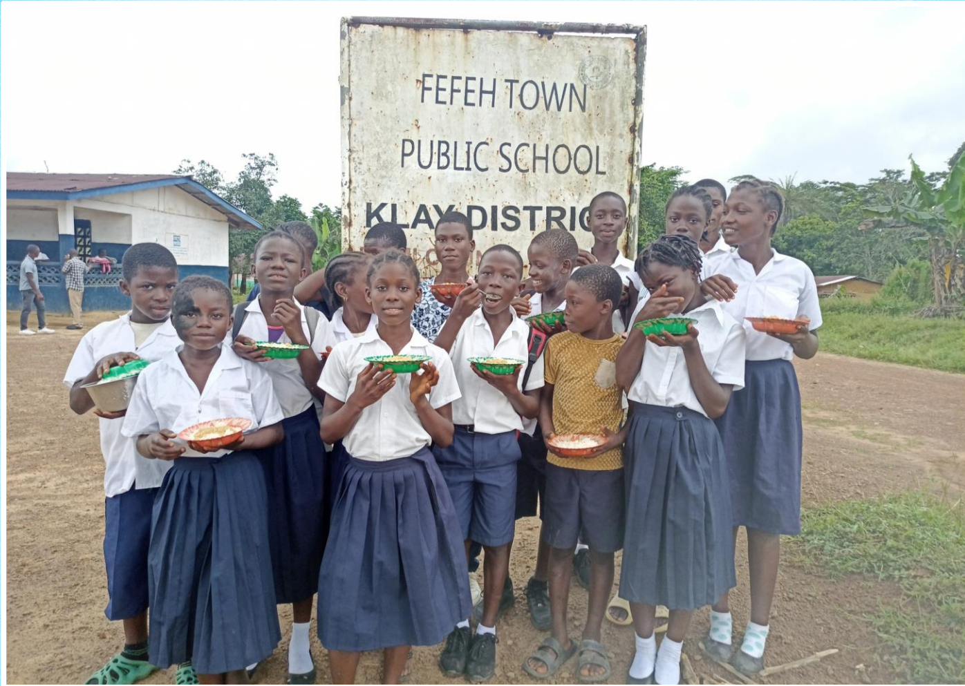
Fefeh Town Public School