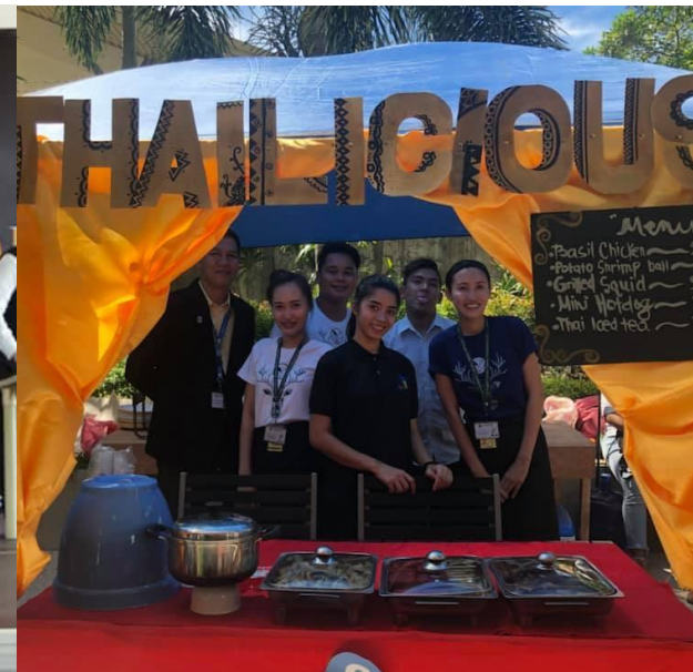
Food Festival Day