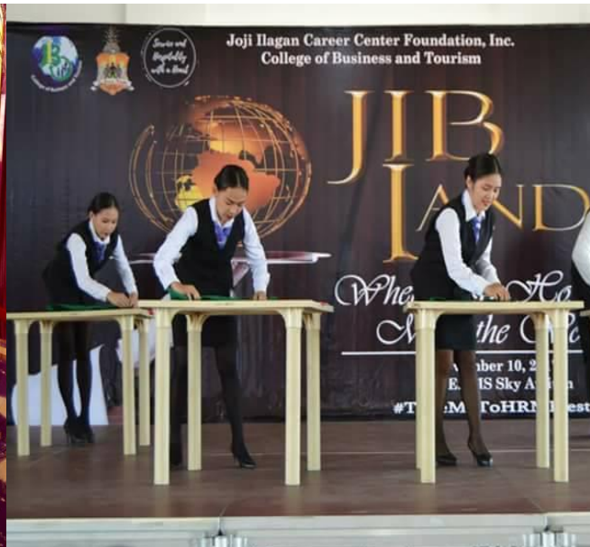
Hospitality Management Day