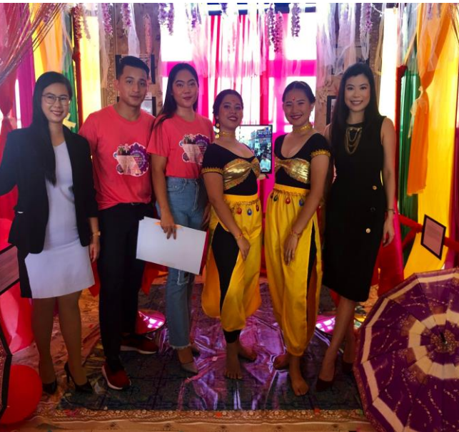
World Tourism Day