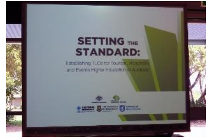
Teaching & Learning Outcomes