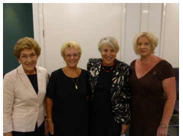
Welcome reception at the Parliament House