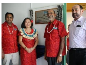
Official opening of USP's Nadi Training Centre in Fiji