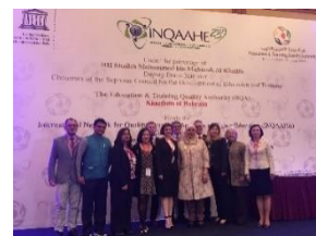
INQAAHE Board of Directors