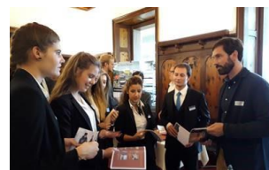
Students and industry engage at the SSTH Career Day

Also in September, the Swiss School of Tourism and Hospitality (SSTH) hosted their annual Career Day, giving students an insight into the fascinating working environment of hospitality and tourism, and the possibility to be recruited by top employers.