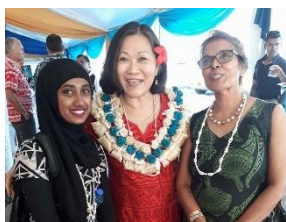
Celebrating the auspicious occasion