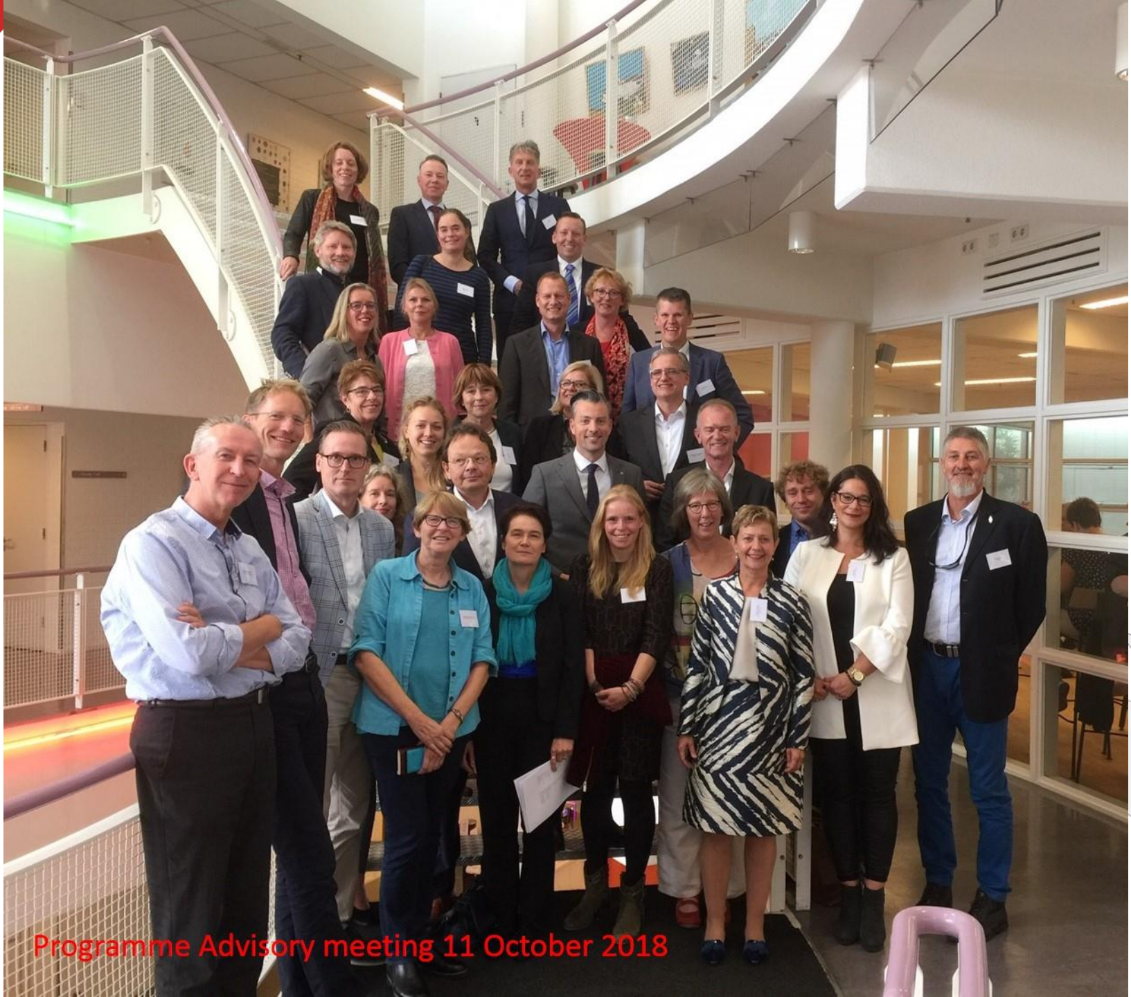
Programme Advisory meeting 11 October 2018