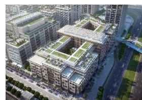
Artist's rendition of new Dubai College of Tourism facilities

Observer of THE-ICE, Dubai College of Tourism, officially opened in January 2018, launching their first programme, Certificate in Tourism. In August 2018, the college will move to a brand new facility shared with Dubai Tourism Commerce Marketing (DTCM) next to the Dubai World Trade Centre.