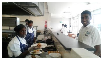
Nadi Tourism & Hospitality Centre students prepare a meal at the restaurant

The Nadi Tourism & Hospitality Centre was honoured to open its restaurant in July 2018. The restaurant is open to the public, with students gaining live, practical experience as part of their food and beverage training. This initiative will further help them gain an increased level of practical skills to become work-ready graduates.