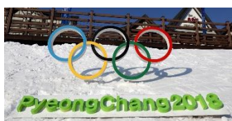
PyeongChang 2018 Winter Olympics