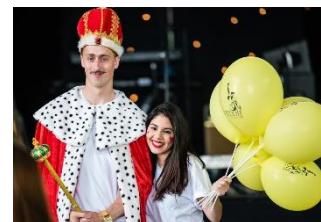
Over 8,500 visitors attended Freddie For A Day 2018

The fifth iteration of the student-organised Freddie For A Day event attracted over 8,500 visitors to Montreux to experience concerts, performances, raffles, and gastronomic specialities from around the world. The 2018 weekend-long event raised almost 25,000 CHF (over $25,000 USD) and all funds will be donated to the Mercury Phoenix Trust Foundation, to be allocated to charity projects focused on fighting HIV/AIDS around the world. In the past 21 years, the trust has given away over $15million in music icon Freddie Mercury's name and funded over 700 projects in the global battle against HIV/AIDS.