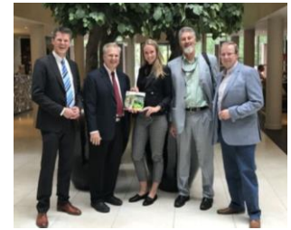
Members of THE-ICE and NVAO joint accreditation projects panel

THE-ICE and NVAO have completed their first joint accreditation projects to the great satisfaction of all parties involved.