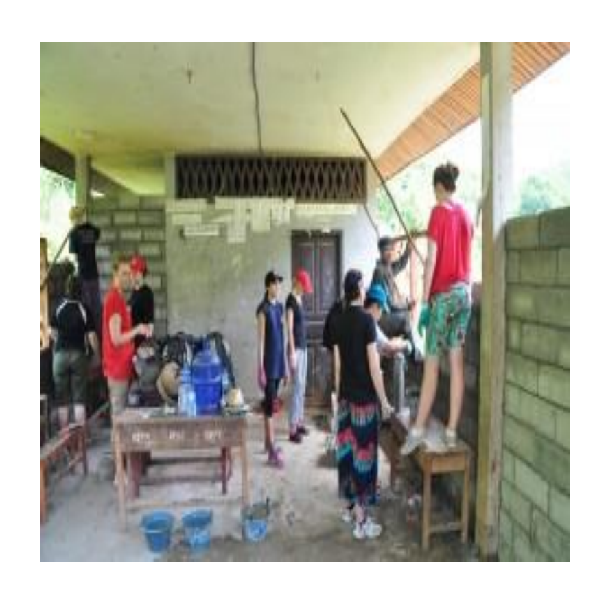
Renovating a high school classroom